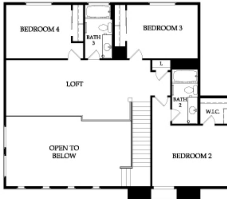
ELEVATION 'A' Second Floor