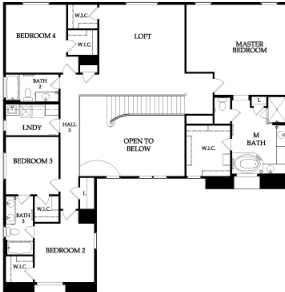
ELEVATION 'A' Second Floor