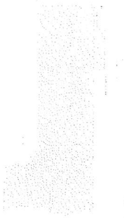
BUILDING PLAN FIRST FLOOR