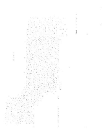
BUILDING PLAN SECOND FLOOR