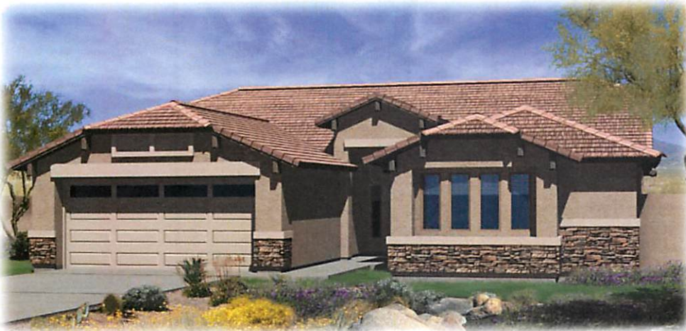
Elevation C Shown with Optional LedgeStone (Standard in Select Neighborhoods - See Sales Associate)

PLEASE NOTE for Desert Ridge Only: Color Blocking is not reflected in Artistic Renderings. Please see Sales Associate for locations of Color Blocking.