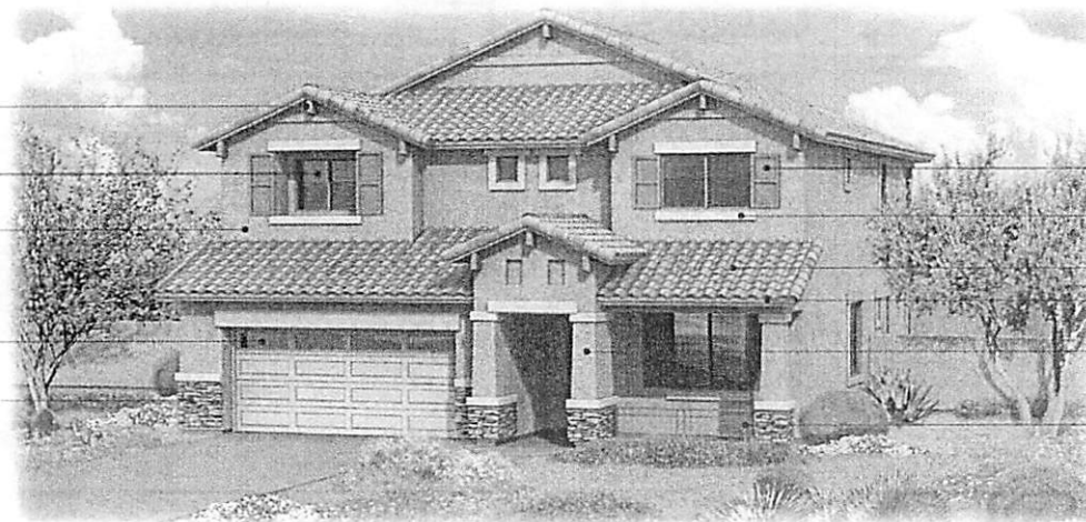
Elevation C Shown with Optional LedgeStone (Standard in Select Neighborhoods - See Sales Associate)