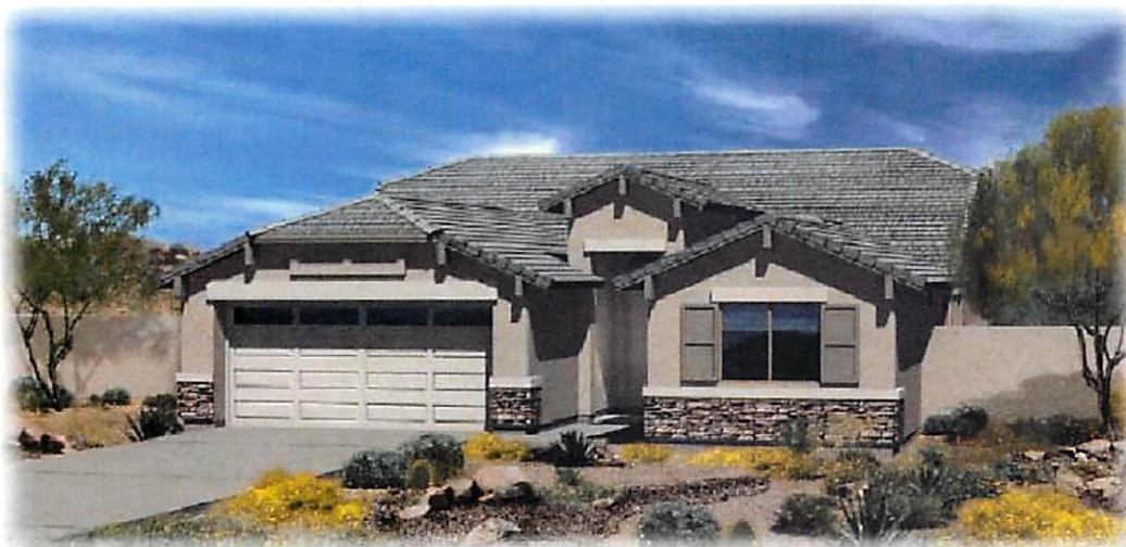
Elevation C Shown with Optional LedgeStone (Standard in Select Neighborhoods - See Sales Associate)