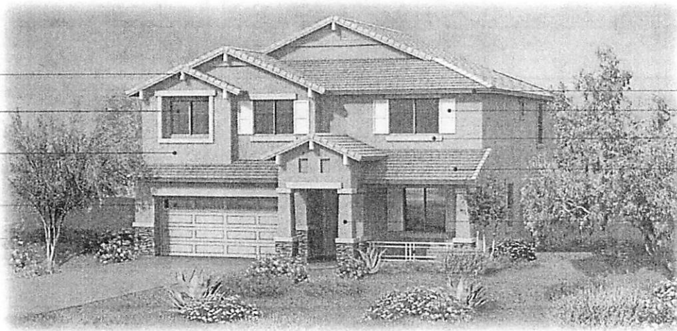
Elevation C Shown with Optional LedgeStone (Standard in Select Neighborhoods - See Sales Associate)