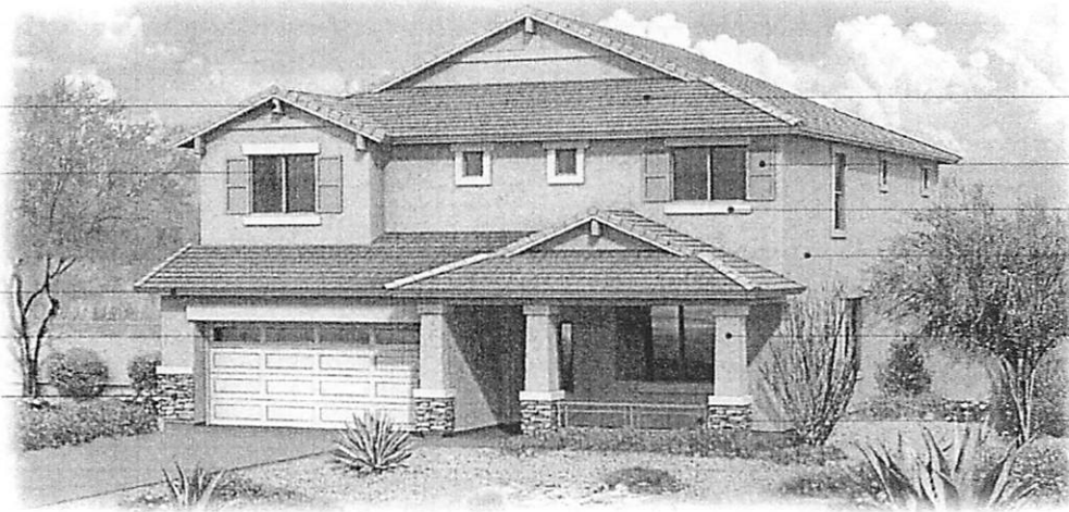
Elevation C Shown with Optional Ledgestone (Standard in Select Neighborhoods - See Sales Associate)