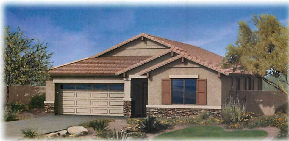
Elevation D Shown with Optional LedgeStone (Standard in Select Neighborhoods - See Sales Associate)