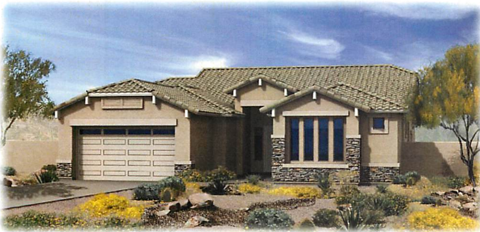
Elevation C Shown with Optional LedgeStone (Standard in Select Neighborhoods - See Sales Associate)

PLEASE NOTE for Desert Ridge Only: Color Blocking is not reflected in Artistic Renderings. Please see Sales Associate for locations of Color Blocking.